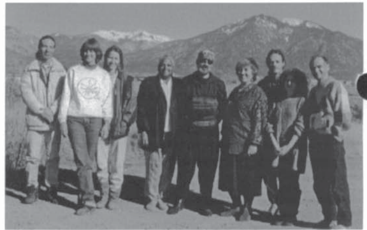
Participants of the first Advanced training last year in Taos.

The only advanced training of this tour is in Taos, New Mexico. Taos is a gorgeous place, especially in fall, the right setting for this six-day adventure into self-discovery. The